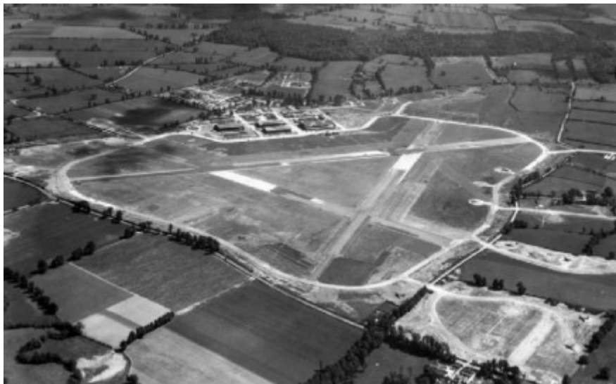
Wellesbourne Airfield during World War 2

A quick look at the local map reveals eight RAF WW2 airfields within a 10 mile radius of Stratford. A few of our residents may remember these airfields being used in anger while far fewer will have witnessed their construction. They are visible on maps but are frequently hidden from the road. We pass them regularly without realising they are there and with little idea of the key roles these airfields played for the Allies in WW2.